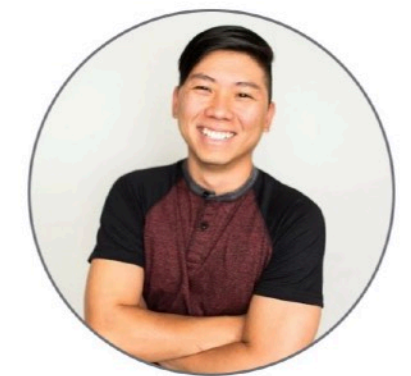
En Tao Ko @magnifiedjoy